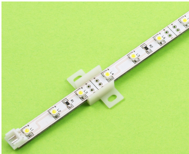
Broadway Light Bar with a mounting clip